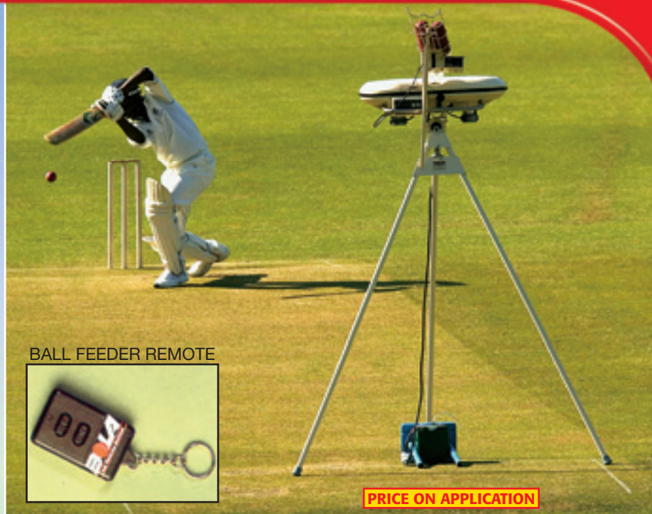
BALL FEEDER REMOTE

NOW HAS RANDOM DELIVERY FUNCTION NEW CONTROL PANEL CIRCUITRY