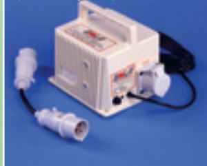
POWER PACK (Mains Option)